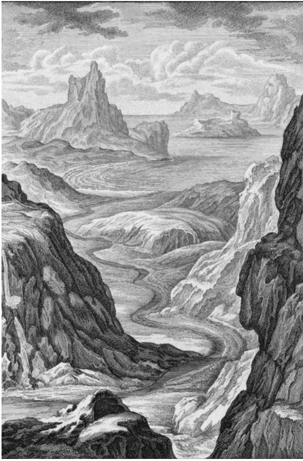
Figure 3. The third day of Creation as depicted in plate VI to illustrate Genesis 1:9–10 in Johann Scheuchzer's Physica Sacra ( Sacred Physics , 1731).

modern continents was eroded from the ocean basins, this begs the question of how whole ecological communities of organisms and coral reefs could be transported intact and without mixing across great distances to be deposited preserving their original ecological zonation.