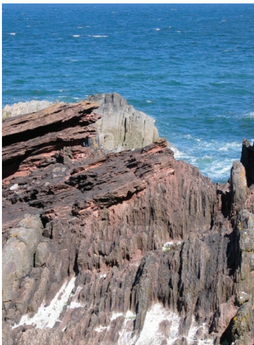
Figure 2. James Hutton's unconformity at Siccar Point, Scotland—the contact between the gently inclined Devonian Old Red Sandstone and vertically dipping Silurian graywacke that established a compelling case for the vast scope of geologic time. The expanse of time required to uplift and erode the two mountain ranges that were the source for the sand in these deposits was unimaginable to Hutton.

A century later, geologic history began to challenge theological tradition after discoveries like James Hutton's unconformity, separating two distinct sandstones, at Siccar Point (Fig. 2) demonstrated that Earth's history was too complicated to be accounted for by a single flood, no matter how big. Mainstream theologians willing to allow that there was more to the geological story than laid out in the Bible, and that the days of creation may have been allegorical, were less inclined to give up on the reality of a global flood. Many believed that the biblical flood inaugurated the most recent geological age. The lack of human remains in rocks thought to pre-date the flood was widely considered to confirm this view.